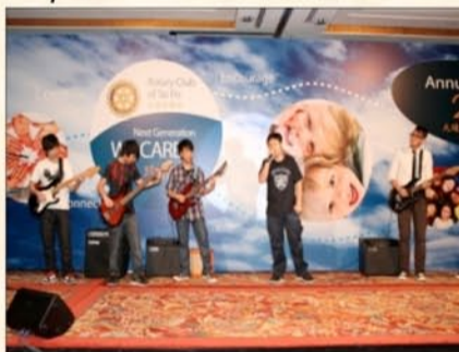
Project "Strive for the Summit" participants gave us a band performance

The younger generation drives the fundraising initiatives