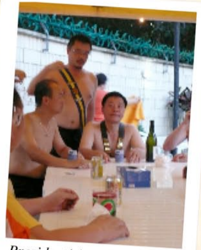
President(s) and Sergeant ready for meeting