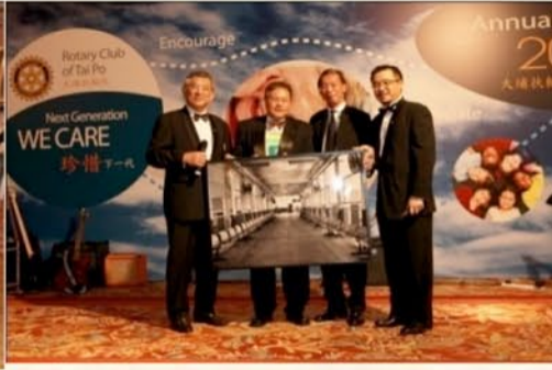
Highest bidder of the exclusive photo