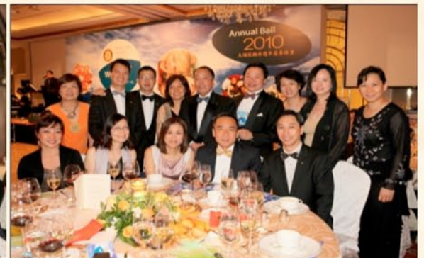
Presidents of District 3450

The younger generation drives the fundraising initiatives