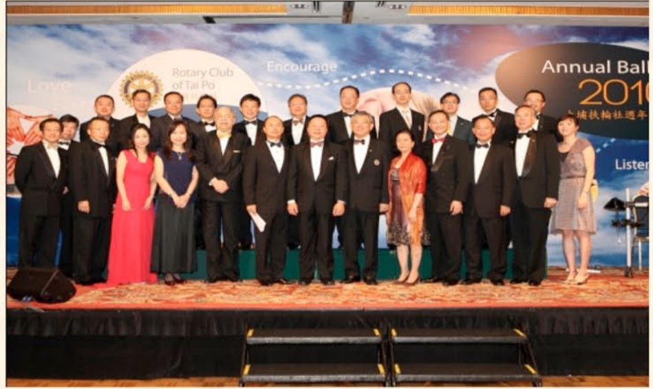
Tai Po Members