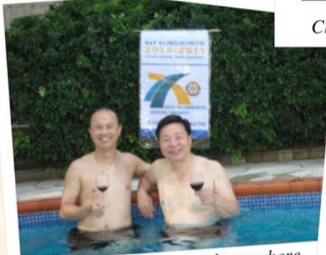
Presidents shared a drink anywhere