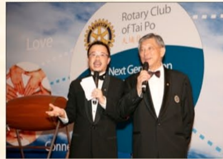
The Fund raising duet