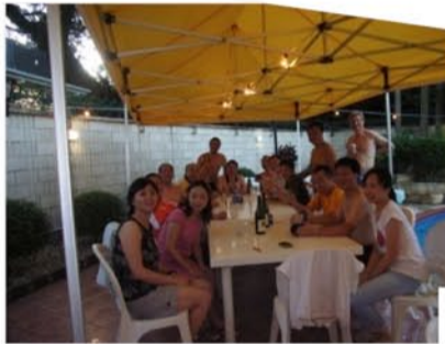
Club meeting in progress