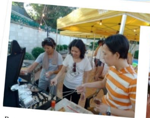
Rotaryannes - backbone of our club