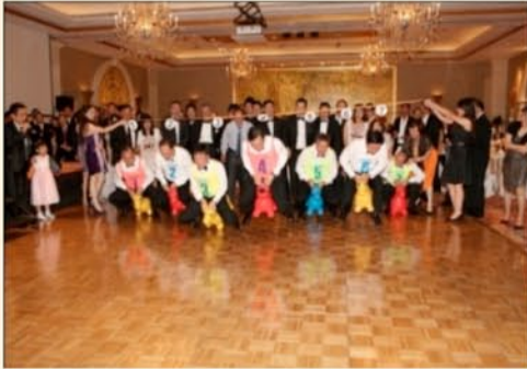
Go! Go! Go! Race for Fund