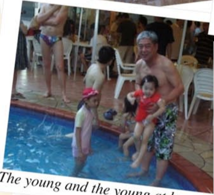
The young and the young at heart