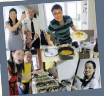
Like Chinese, the Brazilian are serious about eating business. It is all you care to eat in Brazil

are abandoned by their husbands. Each Rotary club would share with you their unique way of putting "Humanity in Motion". And we have visited 29 Rotary clubs in D4420.