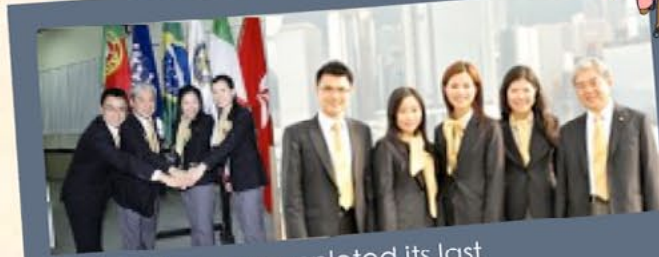
The GSE team completed its last presentation A sigh of relief for a Mission accomplished