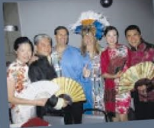
Chinese traditional outfit at Governor's ball