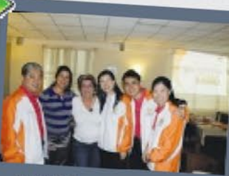
A visit to a very unique club with over 30 female members, the President Elect is the only gentleman in the Rotary club of Santos Boqueirao