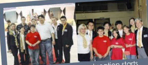
The Rotary kids- Rotary education starts at the tender age of 8, Rotary has become a family affair