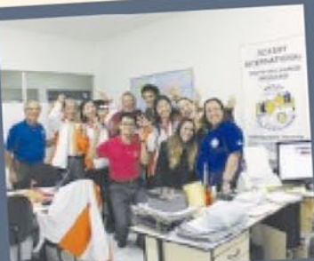
An inspirational experience at the Youth Exchange Center talking to many bright young students from many different countries – Bridging Continents in action