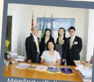
Meeting with the beautiful Major of The City of Guaruja