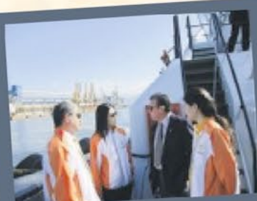
A tour of the Port of Santos, the biggest port in S. America at a brand new tug boat with a PDG