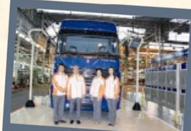
A big truck was born- vocational visit to Mercedes assembling plant