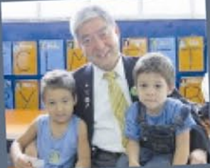
Visit to Rotary Joaquim Fernndos Children School