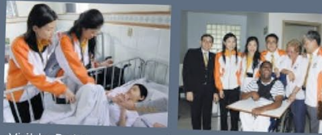
Visit to Rotary sponsored center for the Cerebral-paralysis