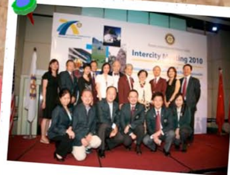
at Ballroom of Holiday Inn Golden Mile Hotel on 17 Aug 2010