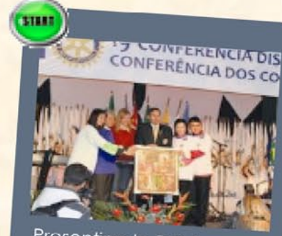
Presenting to DG Barroso gifts from D3450