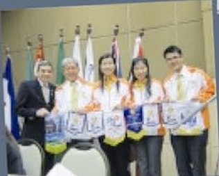
Visit to one of the strongest club in D4420, the RC Santos Porto