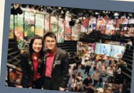
A visit to Redo Globo Altas Horas, the most popular TV Show in São Paulo