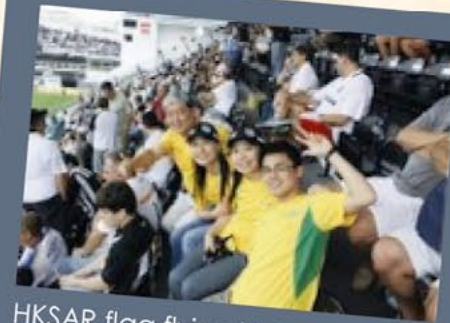
HKSAR flag flying high at meeting of RC Guauja Vicente de Carvalho

Number of Rotarians of D4420 were mobilized: over 200