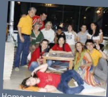
Home stay is what makes GSE special and fun. We were treated like part of the family