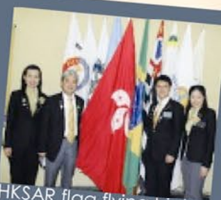
HKSAR flag flying high at meeting of RC Guauja Vicente de Carvalho