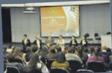
A lecture on the Comparative Advantage of HK to a group of Interational buisness students at Universidadae Municipal De São Caetano Do Sul