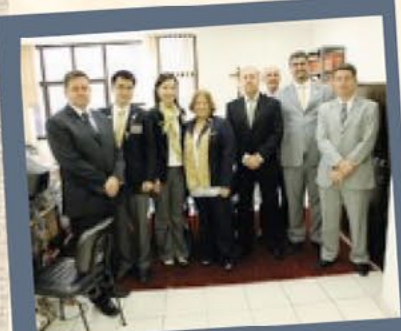
A visit to Civil court of Santos candid discussion with three civic judges on Social injustice