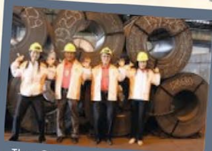
The GSE team at the Usimimus Steel Mill