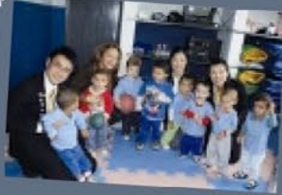
For the poor people at Guaruja, Santos