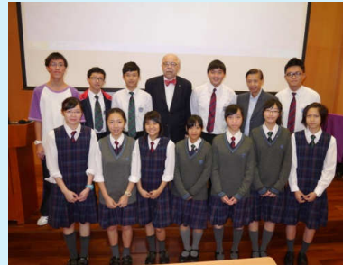
Attended Interact Club of TTCA club officers Installation in Dec. 2012.