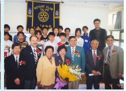
Attended closing ceremony of our English Enhancement Program for newly arrived immigrant students at Li Po Chun United World College in 1998.