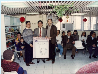
Presented gift to elderly home in Tai Po during our club's visit Jan. 1996.