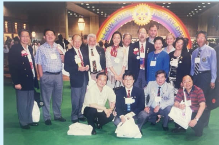
Attended RI Convention in Singapore Jun. 1999 as 98/99 District Governor.