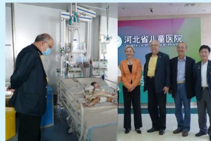
Visited Child Hospital of Hebei Province for our support to RC Beijing's Gift of Life project for children with congenital heart disease; May 2011.