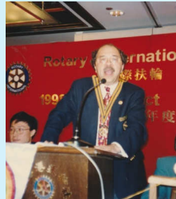
At District Change-over meeting Jul. 1998 in New World Hotel, TST.