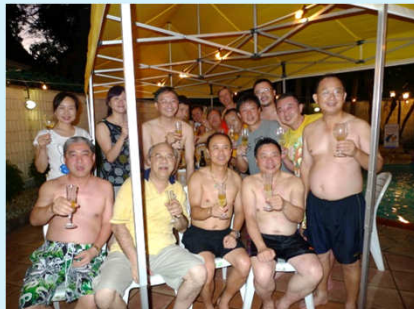
At pool side BBQ change-over party at PP Man's home in Tai Po, 1 Jul. 2010.