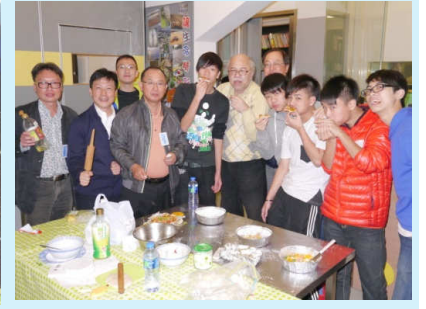
At Star Reaching Program cooking activity in Jan. 2013.