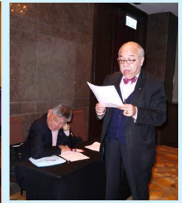
Announced voting results at RCTP AGM in Dec. 2012.