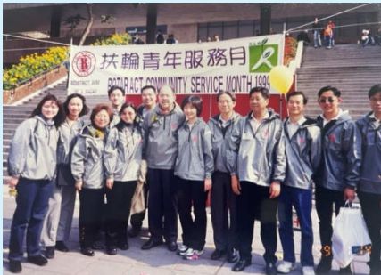
At Rotaract Community Service Month activity with Rotaractors and Rotarians outside Shatin New Town Plaza in Jan. 1999.