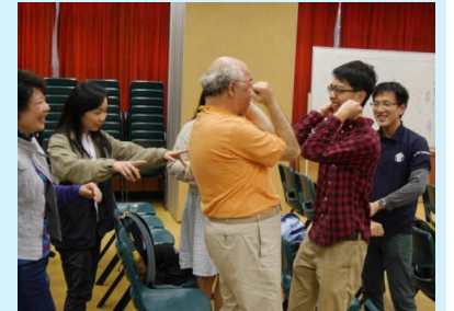
Interaction with Rotaractors at youth joint meeting at TTCA school hall in Mar. 2015.