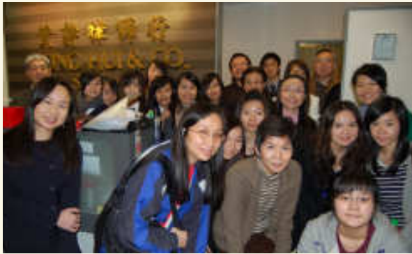
Law firm visit for Shinning Face project 2010