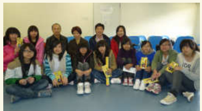
Shinning Face camp visit 2011