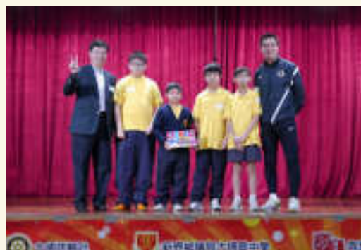
Sunshine Teens soccer game & closing ceremony 2012