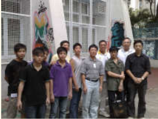
BBQ party with "Strive for the Summit" students at HYKTPDSS 2008 (Graffiti on wall painted by students)