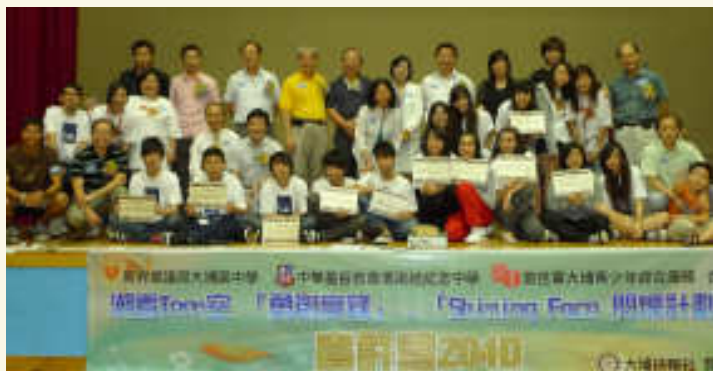
Closing ceremony 2010