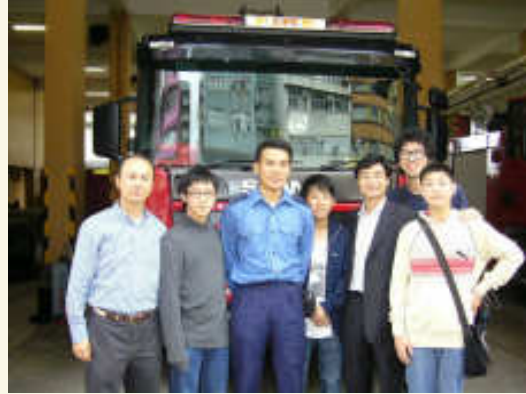
Fire Station visit 2008