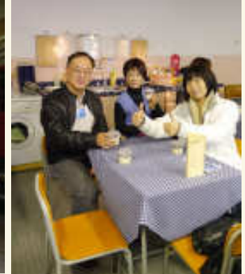
Coffee making class at Lee Hing Kwai Sec. Sch 2012