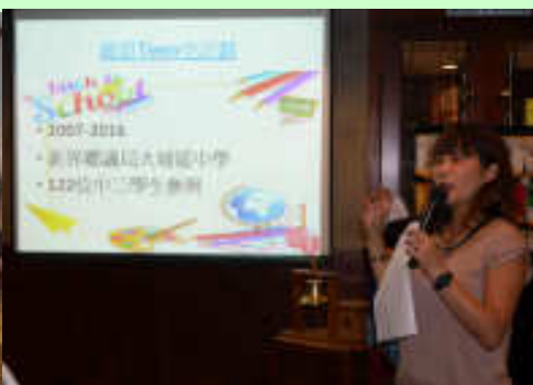
Representatives from the Salvation Army reported on this year's activities and previewed the approaching Closing Ceremony of Sunshine Teens and Strive for the Summit.