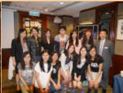
Rotaractors from the 'new' board of RAC WYS College came to introduce themselves and told us something about their plans for the year.