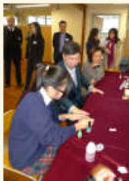
Sunshine Teens Opening & Closing Ceremony 2011