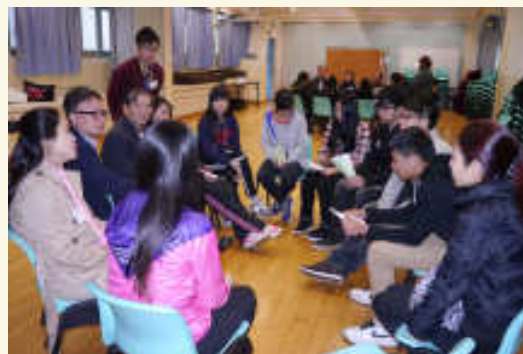
「潮看Teen空」 After camp visit 2013