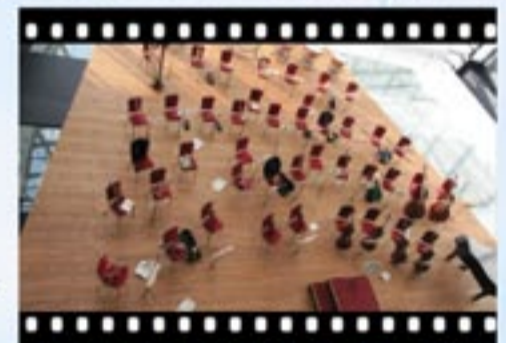
A Wall of Italian Orchestra