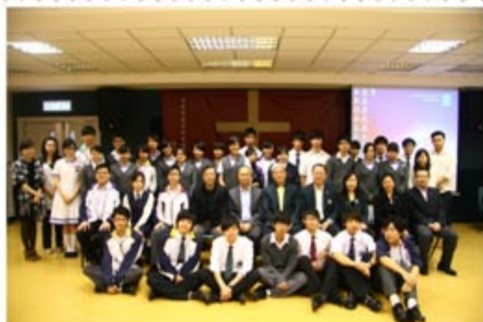
Everyone at the Installation