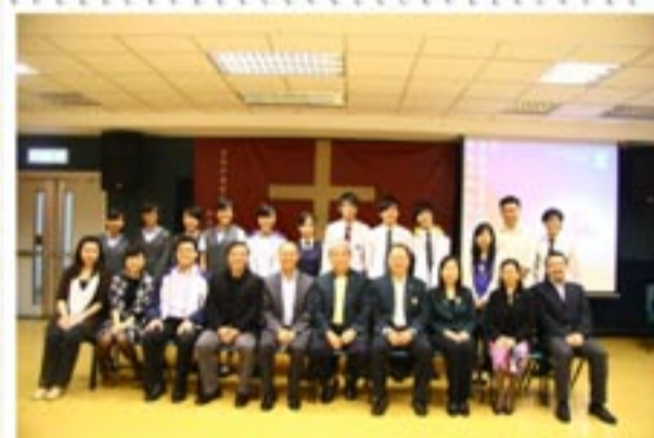
The New Board with Teacher Advisors, Tai Po Rotarians and Rotaractors