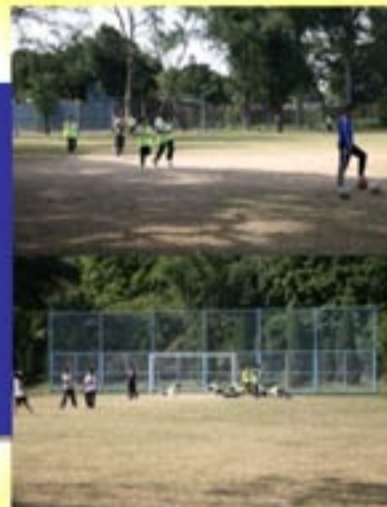
Getting ready for the football match. The losing team is punished by having to do push up. Final score was 4:0.