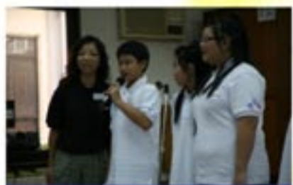
Students shared their feelings of the camp