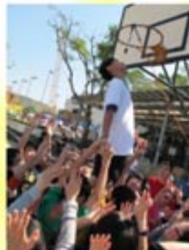
Ice breaking! Team building!