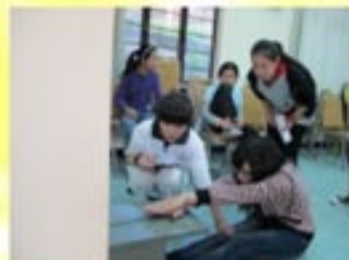
Are you physically capable?