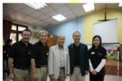
The Rotary team with same smile! What a fruitful day!

Even though the secondary 1 students appear fresh and like little kids, this group of youngsters is the hope and future of our community. "Sunshine Teens" is showing our care to the future of our community. Serving with love, hope and care, Rotary Club of Tai Po aims to build a brighter future for our community, because "Next Generation We Care".