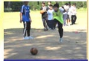
GOAL! GOAL! GOAL!!