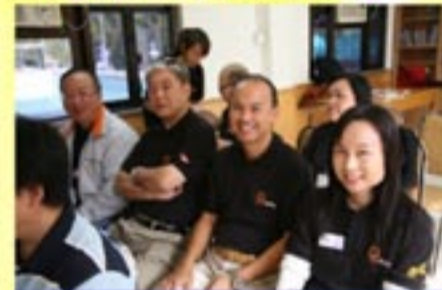
We listened ....