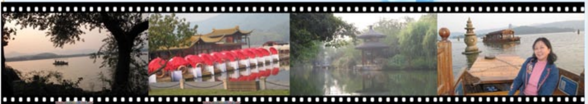
Panoramic West Lake