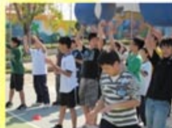
We can DANCE!!!