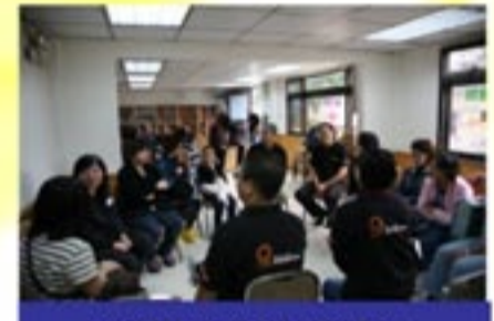
... and We talked with the parents as well. All of us learnt a lot!