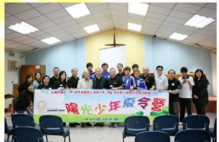
The successful joint force between Rotary Club of Tai Po, Prince of Wales Hospital, Tai Po Wofoo Football Club, Salvation Army, and NT Heung Yee Kuk Tai Po District Secondary School