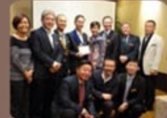
10K Runners and cheering team being recognized